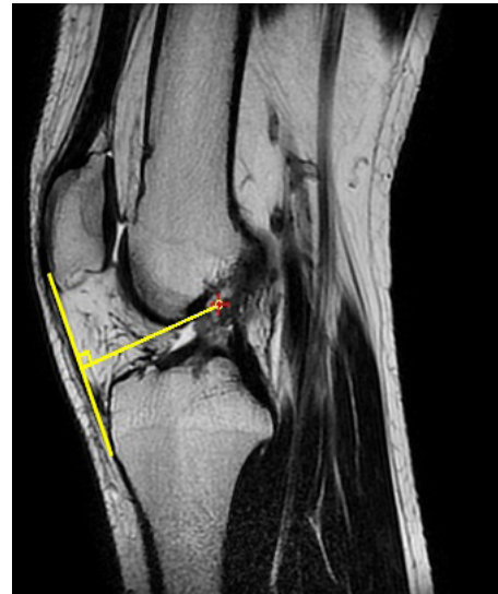
Figure 1. Measuring of patellar tendon (PT) moment-arm. Medial and lateral condyles were fitted with circles and the axis passing over the centers of the condyles was considered as the center of joint rotation in two and three dimensions. (a) Posterior view and (b) sagittal view (12).