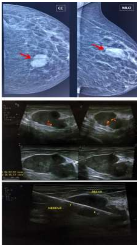
Figure 2. Mammography, ultrasound, and ultrasound-guided core needle biopsy from a left breast mass (BI-RADS 3), which was proved by pathology to be a fibroadenoma.